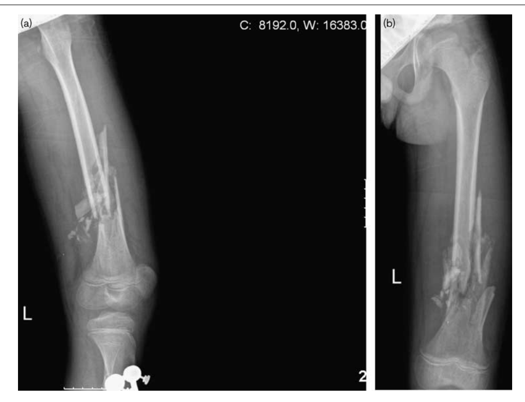
(a and b) Open comminuted distal third femur fracture in a 9-year-old boy.