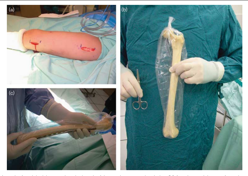
(a) Skin incisions. Length of each incision matches the length of three subsequent plate holes. (b) A cadaver adolescent femur in a sterile plastic bag. (c) Plate precontoured.